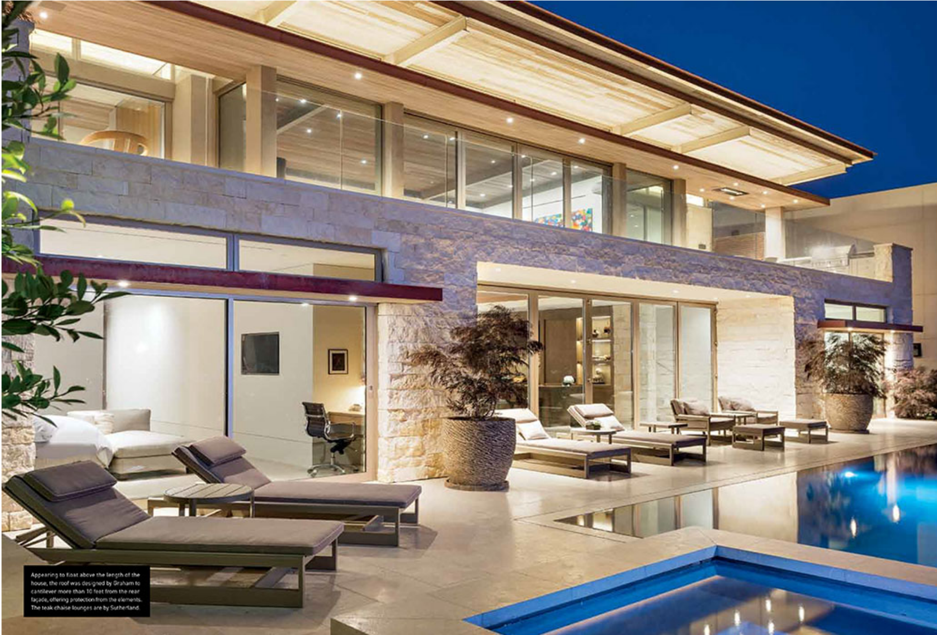
Appearing to float above the length of the house, the roof was designed by Graham to cantilever more than 10 feet from the rear facade, offering protection from the elements. The teak chaise lounges are by Sutherland.