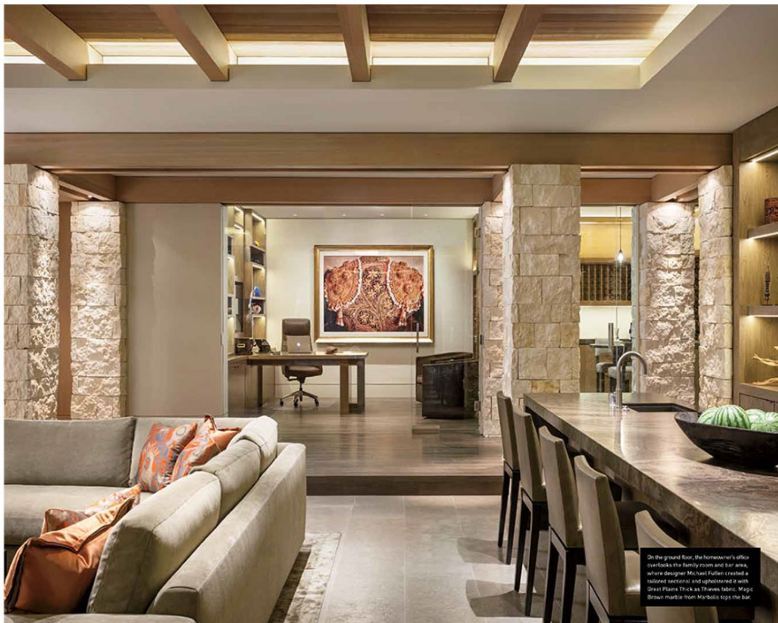
On the ground floor, the homeowner's office overlooks the family room and bar area, where designer Michael Fullen created a raised sectional and upholstered it with Great Plains Thick as Thieves fabric. Magic Brown marble from Marbolis tops the bar.

Working within that nuanced palette, Graham devised a floor plan informed by the site, as well. “Every bedroom and living area has an ocean view,” says the architect, who achieved that by placing two bedroom suites on each floor and separating them with open public spaces in the center. The back of the house opens almost entirely through glass sliding and bifold doors to merge the interior and exterior spaces. To help define the rear façade, he designed a cantilevered roof that acts “like a giant umbrella that shades the interior from our year-round sun,” says the architect.